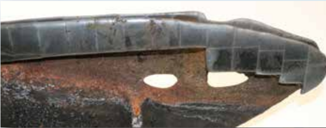
Close up view of reinforced Tungsten Carbide on a GET dryer flight with more than 7,200 hours.