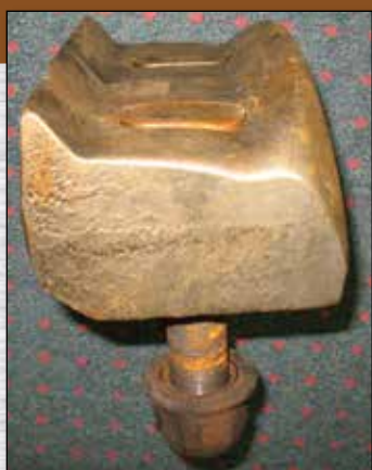
Good Earth Tools specifically designed the Carbide for this high-impact hammer application.

Good Earth Tools can help you lower operating costs and produce a higher quality product!