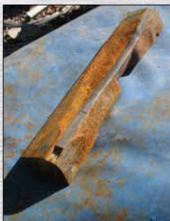
Competitors' VSI hammers are ineffective in just a few days.