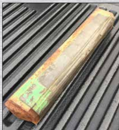
After the same amount of run time, the GET VSI hammer still has plenty of life remaining.

GET = Long-Lasting Solutions For Crusher and Pulverizer Wear Problems