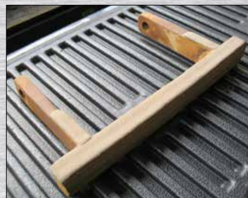
GET hammers with TigerCarb last more than three times longer than the steel hammer with hardfacing.